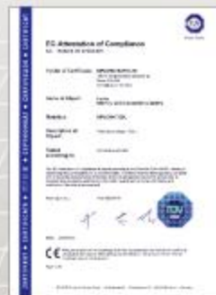
▶ CE (EU)