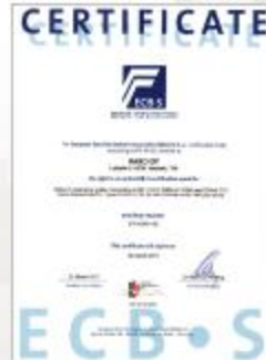
▶ ECB-S (EU)