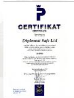
▶ SP (Sweden)