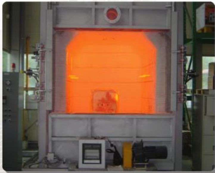
► Heating Test