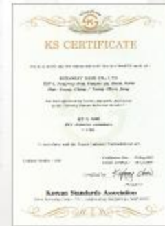
▶ KS (Korea)