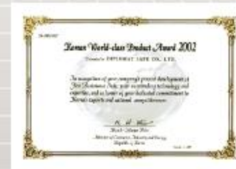
▶ Korean World-class Product Award