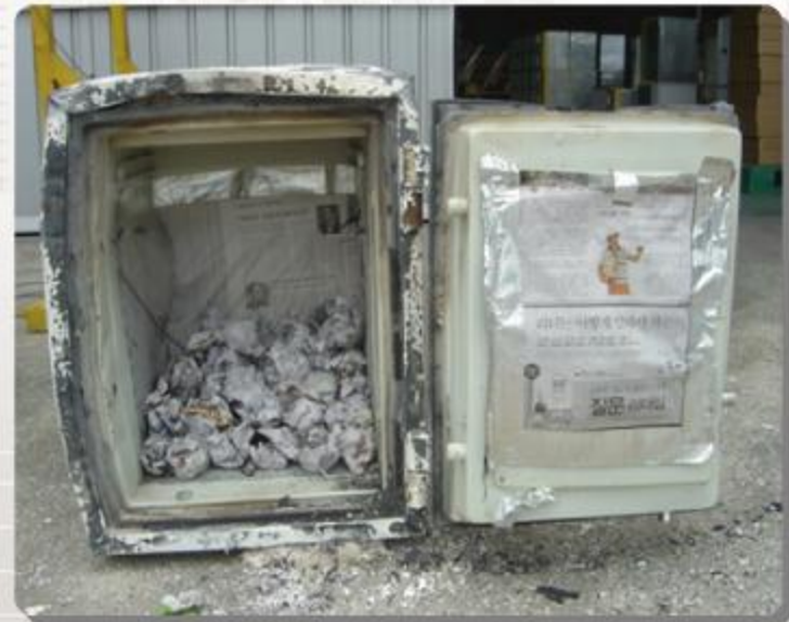
► After Test