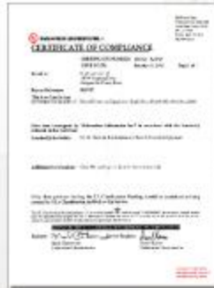
▶ UL (USA)