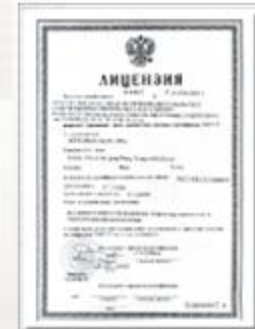
▶ GOST (Russia)